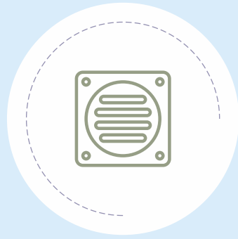
UNDER GROUND DRAINAGE & SEWER