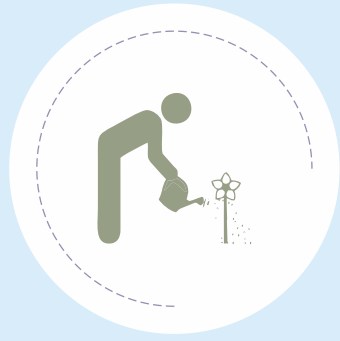
GARDEN & ROAD SIDE PLANTATION