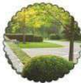
Garden and Open space