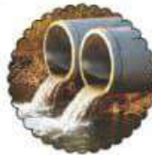
Drainage & Sewerage line