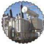
Transformer with Underground Electrical line