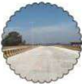
Cement Concrete Road