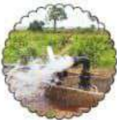
Drinking & Boring Water