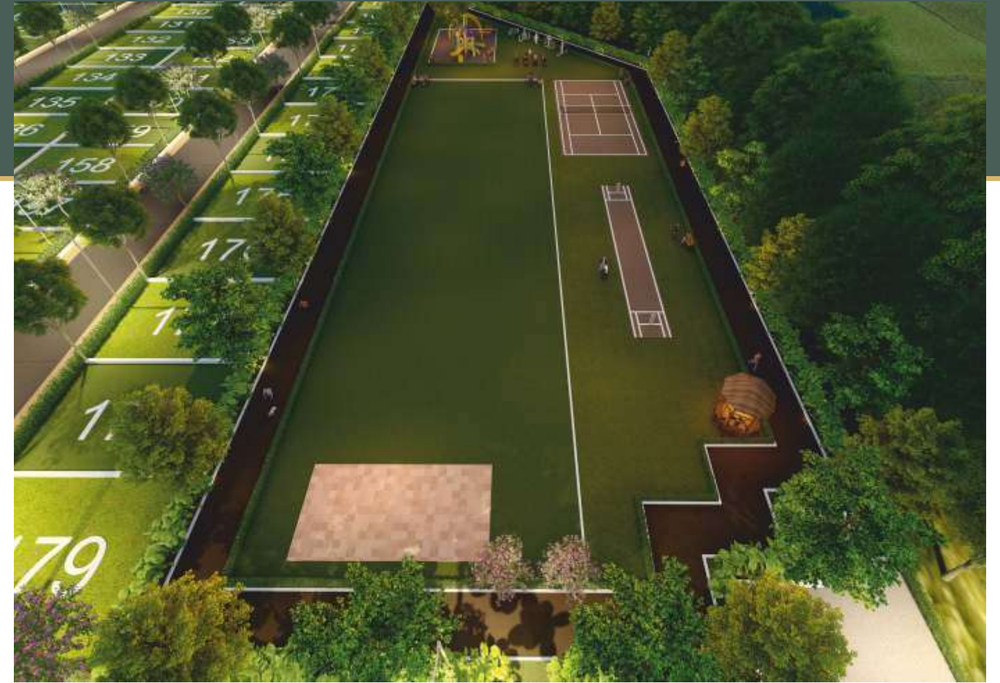
PARTY LAWN & MULTIPURPOSE SPORTS ARENA