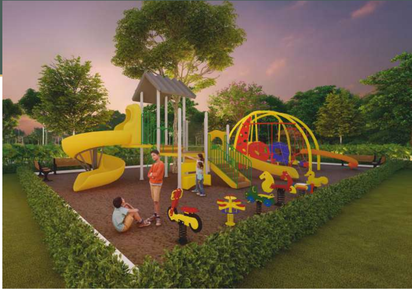
KIDS PLAY AREA & SAND PIT